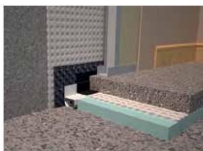
A typical technical drawing of Newton System 500 being applied to a structure